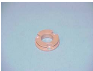
WM150 1 \frac{1}{2} " Hand Connection Plate, Mechanical For Steeper 2" Mechanical hands