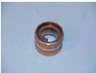
WU125 Steeper Lightweight Friction Wrist Unit 1 1/4" diameter For 0-3 SCAMP hands only; no connection plate required

All wrists are sized to match a particular hand or gripper. When ordering, check to ensure that the wrist matches the size of the terminal device. Most wrists come with Lamination Collars for mounting to the prosthesis. Many wrists require that the terminal device also be supplied with the appropriate connection plate for compatibility.