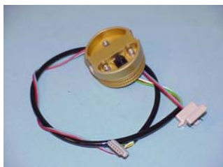
UW101-FR Centri Quick Change E Riction Wrist