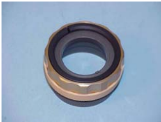
WU200 Steeper Lightweight Friction Wrist Unit 2" diameter For 2 \frac{1}{4} , 3, 3 \frac{1}{4} " mechanical hands; 2 \frac{1}{4} " electric hands; use with WE200