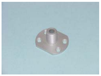
AP212 – Hand Connector Plate, Oval Use with all RSLSteeper 2 1/4" and larger passive hands only