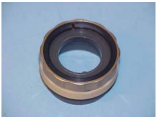
WU210 Steeper Lightweight Friction Wrist Unit 2 \frac{1}{8} " diameter For 3", 3 \frac{1}{4} " Electric hands; use with WE210