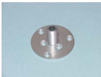
AP210 – Hand Connector Plate, Round, 2 1/8" dia Use with RSLSteeper 3" and larger electric hands and the Powered Gripper