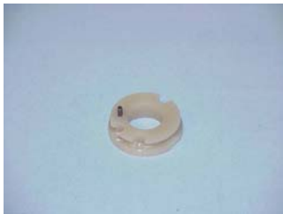
WE175 1 \frac{3}{4} " Hand Connection Plate For Steeper 2 \frac{1}{4} ", 2 \frac{1}{2} " electric hands