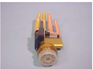
UW101-QD Bock Q uick D isconnect Friction Wrist