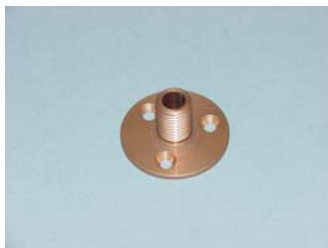
AP150 – Hand Connector Plate, Round, 1 1/2" dia Use with RSLSteeper 2" passive & mechanical hands

These hand connector plates may be used with RSLSteeper Mechanical, Electric or Passive hands. They are the best way to connect to the RSLSteeper Modular Arm or Hosmer wrist with a 1/2" -20 thread.