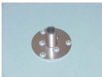
AP175 – Hand Connector Plate, Round, 1 3/4" dia Use with RSLSteeper child's 2 1/4" and 2 1/2" passive, electric and mechanical hands