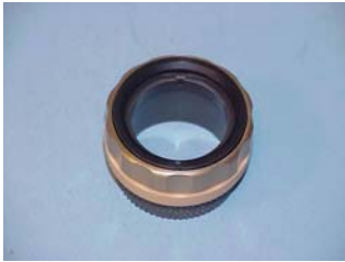
WU175 Steeper Lightweight Friction Wrist Unit 1 \frac{3}{4} " diameter For 2 \frac{1}{4} , 2 \frac{1}{2} " mechanical hands, 2 \frac{1}{4} , 2 \frac{1}{2} " electric hands; use with WM175 or WE175