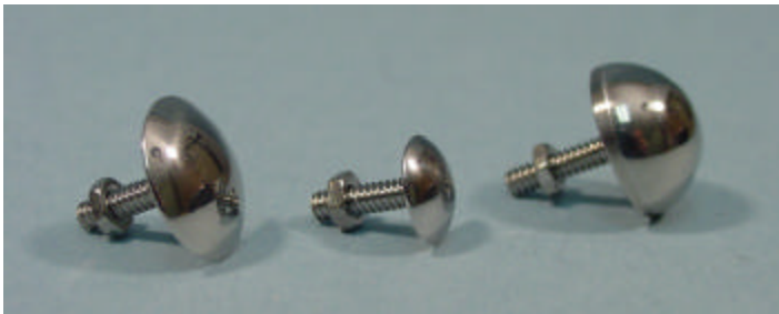
Standard, Small and High Dome Cavity-Back Electrodes

Cavity-Back™ Electrodes improve cosmesis. These metal electrodes are used in test sockets and soft inner socket applications. Attaching cables has always been a problem with separate metal electrodes. With a hard inner socket, a standard 4-40 nut followed by the cable eyelet and a second nut can add a lump ¼ inch (6mm) high. With the Cavity-Back™ feature and a soft socket liner, you will get excellent electrical continuity with just a thin washer, the cable eyelet, and the small pattern 4-40 nut supplied. These components will push the liner down into the cavity. When the stud on the electrode is cut flush with the nut, only the 2mm thick nut and cable will protrude above the surface.