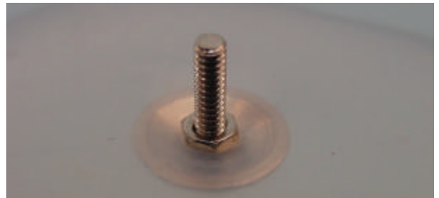
Nut squeezing liner down into the cavity

The Cavity-Back Metal Electrodes are available in three shapes; High, Medium and Small dome. The Medium dome is the standard or default if no other shape is specified. These are used in most applications. The High dome electrode is intended for situations where there is significant soft tissue over the muscle site to assure good contact. Finally, the Small dome is primarily for cases where there are severe space constraints.