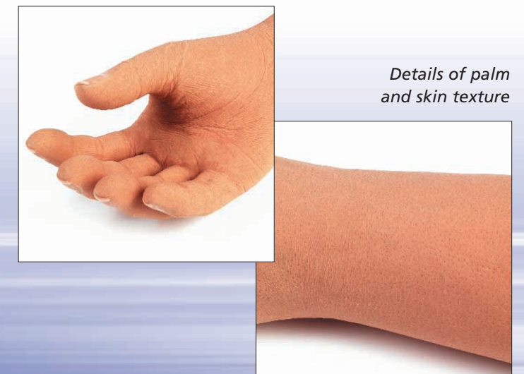
Details of palm and skin texture

These gloves provide a cost-effective solution that will cover prostheses fitted with adult Otto Bock™ electric and system hands. The additional length of these gloves allows them to extend up to and over the proximal edge of the socket, providing a smooth transition to the skin. For trans-humeral and elbow disarticulation prostheses the glove can be trimmed at the elbow fold and the remaining proximal portion used to form a discontinuous cosmesis.