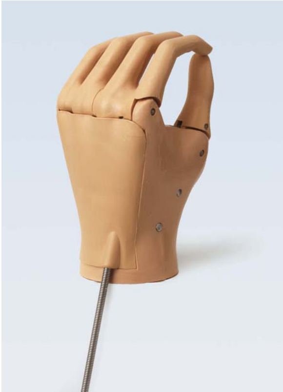
VO Dorsal pull child's mechanical hand