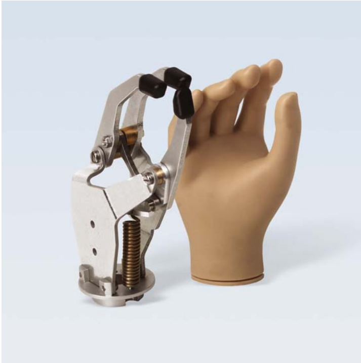
VO Dorsal and Palmar pull adult hand with inner hand shell