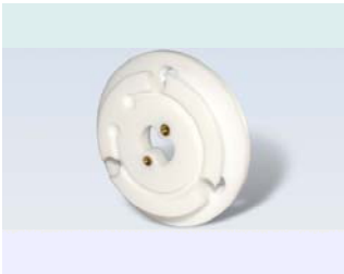
WM175 1 3/4" Hand Connection Plate for Friction Wrist For use with Light-weight Friction Wrists to attach mechanical or electric hand to wrist.. Order with corresponding Light-weight Wrist size (WU175)