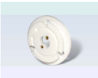
WM200 2" Hand Connection Plate for Friction Wrist For use with Light-weight Friction Wrists to attach mechanical or electric hand to wrist, Order with corresponding Light-weight Wrist size (WU200)