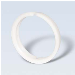
WU174 Friction Ring for use with 1¾" Friction Wrist For use with corresponding Light-weight Friction Wrist (WU175)