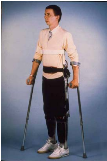
ARGO 90 Assembled

AR100 - Basic Adult Advanced Reciprocating Gait Orthosis Kit ARGO90